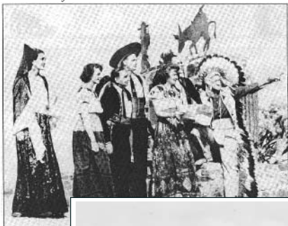
Dedication of the Lost Dutchman Monument - 1938