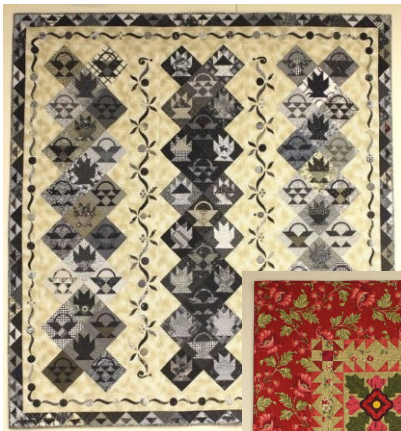
Second Place Exemplary Hand Quilting

The quilt that won first place was named "Roetlich" which means red, and the second place quilt was named "A tisket, a tasket, there is no yellow basket". This quilt also won the ribbon. The third quilt she entered was named "Scrappy Hearts". If you ever have the time, her quilt guilds meet at the clubhouse. The first and third Wednesday at 1pm, and the second and fourth Thursday at 1pm.