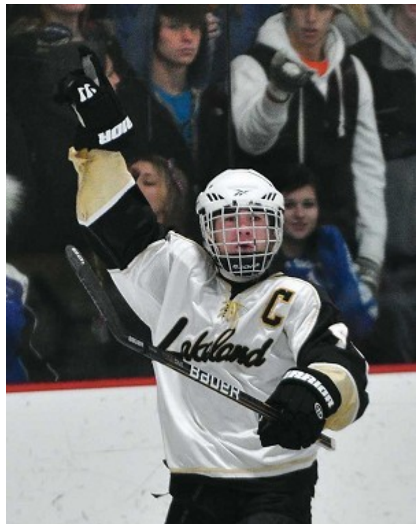
Lakeland's all-time leading scorer moves on after his senior season, but the legacy he leaves behind might never be forgotten as he's rewritten the T-Birds' record book over the past four seasons.