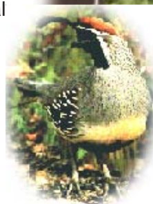
Gambel's Quail family

Gambel's Quail is a common year-round resident among much of Arizona's desert scrub and Desert Harbor. In the spring it's fun to watch the little ones scurry behind their parents in search for food. Like most quail, they live on the ground and will walk or run before they'll fly. Gambel's quail eats leaves, seeds, fruits and small insects. This particular family was seen in southeast corner area of our park before jumping to the parameter wall as they nervously escaped from a pursuing resident with his camera.