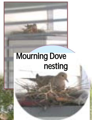
Mourning Dove nesting

Their staple foods are primarily small seeds and cultivated grains. The woeful call of breeding males can be heard as early as February and pairs are known to attempt as many as seven nestings in a single season. Productivity may be high even though the usual clutch size is only two eggs. Incubation takes about 15 days and is accomplished by both parents. The young doves are fed regurgitated "pigeon milk" by both parents and grow and develop rapidly. Residents may regain possession of utility cabinets or other such places when the fledglings leave the nest in 12 to 14 days after hatching.