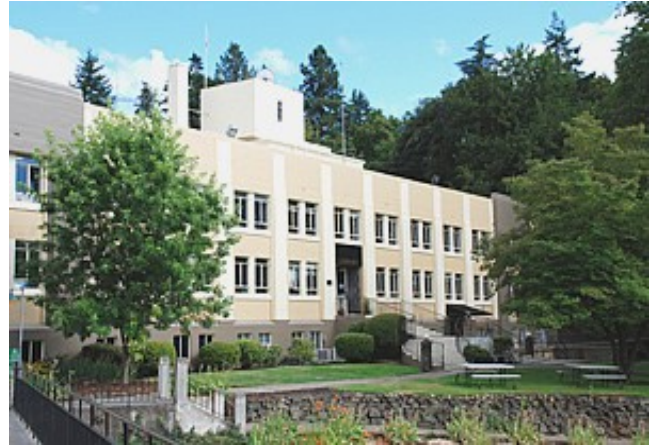
Corban College, Salem Oregon