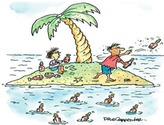
"I think we're missing someone from our holiday card list."