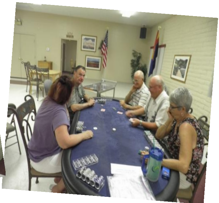
GREAT GAME EVERYONE