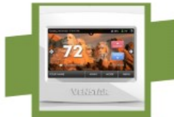
Wi Fi Thermostats