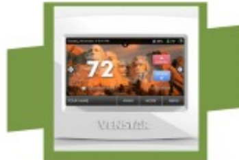
Wi Fi Thermostats