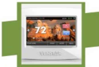
Wi Fi Thermostats