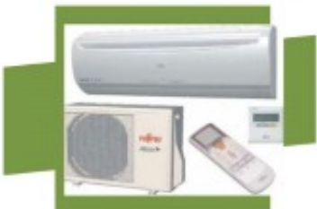
Ductless Mini Splits