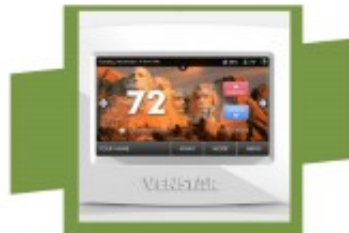
Wi Fi Thermostats