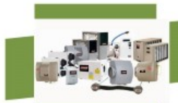
Indoor Air Quality