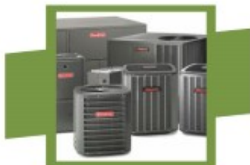
Split and Package