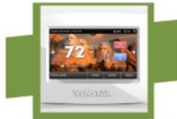
Wi Fi Thermostats