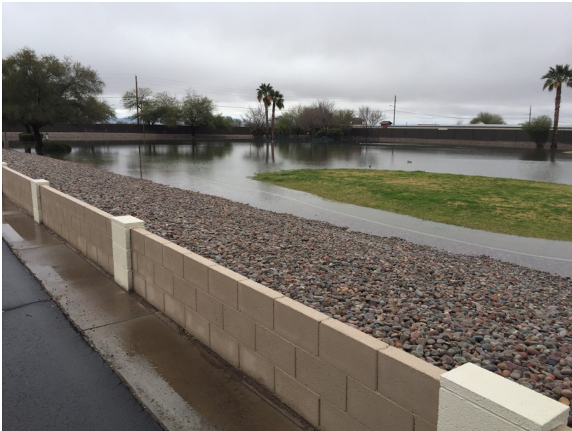
February 22nd, 2019 Snow on Superstition Water On The Golf Course