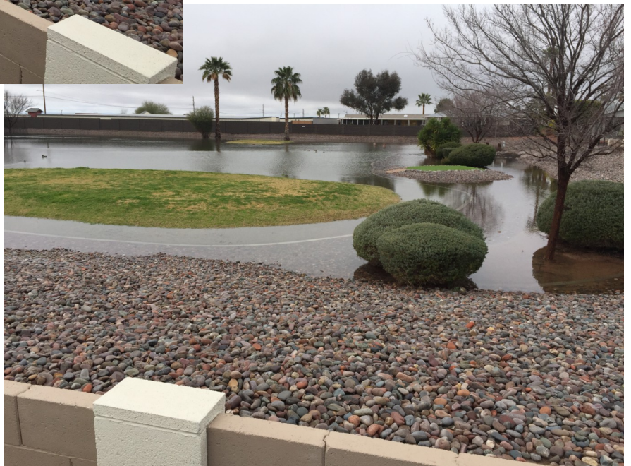
THE NEW HARBOR LAKE AT DESERT HARBOR