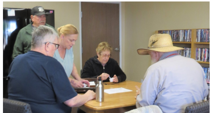
Our tasters hard at work