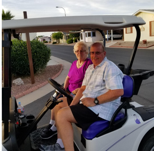
Last year's winners