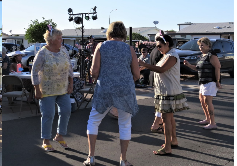
BBQ & Band 4-16-21