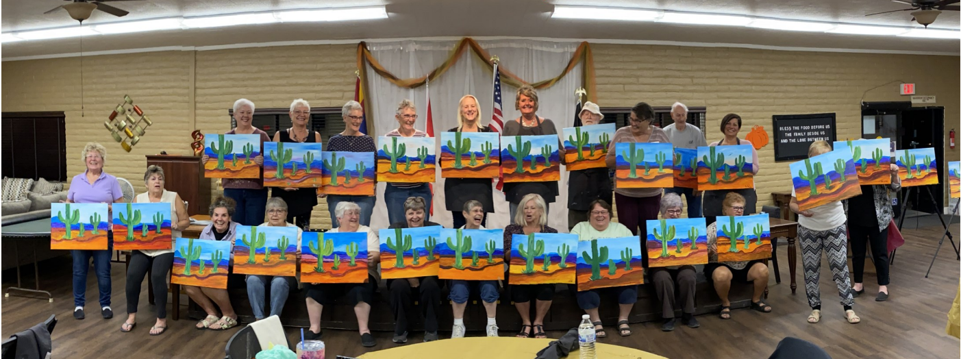
A fun filled evening of sipping wine while painting a picture. There were a total of 23 people that came out to enjoy the wine while painting. It was a very enjoyable evening and we will be doing it again.