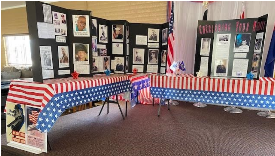
(Memorial Day display 2021)

DESERT HARBOR—A 55+ COMMUNITY—APACHE JUNCTION, AZ—MAY 2022